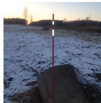
Reflective columns for wells (wells) and for all